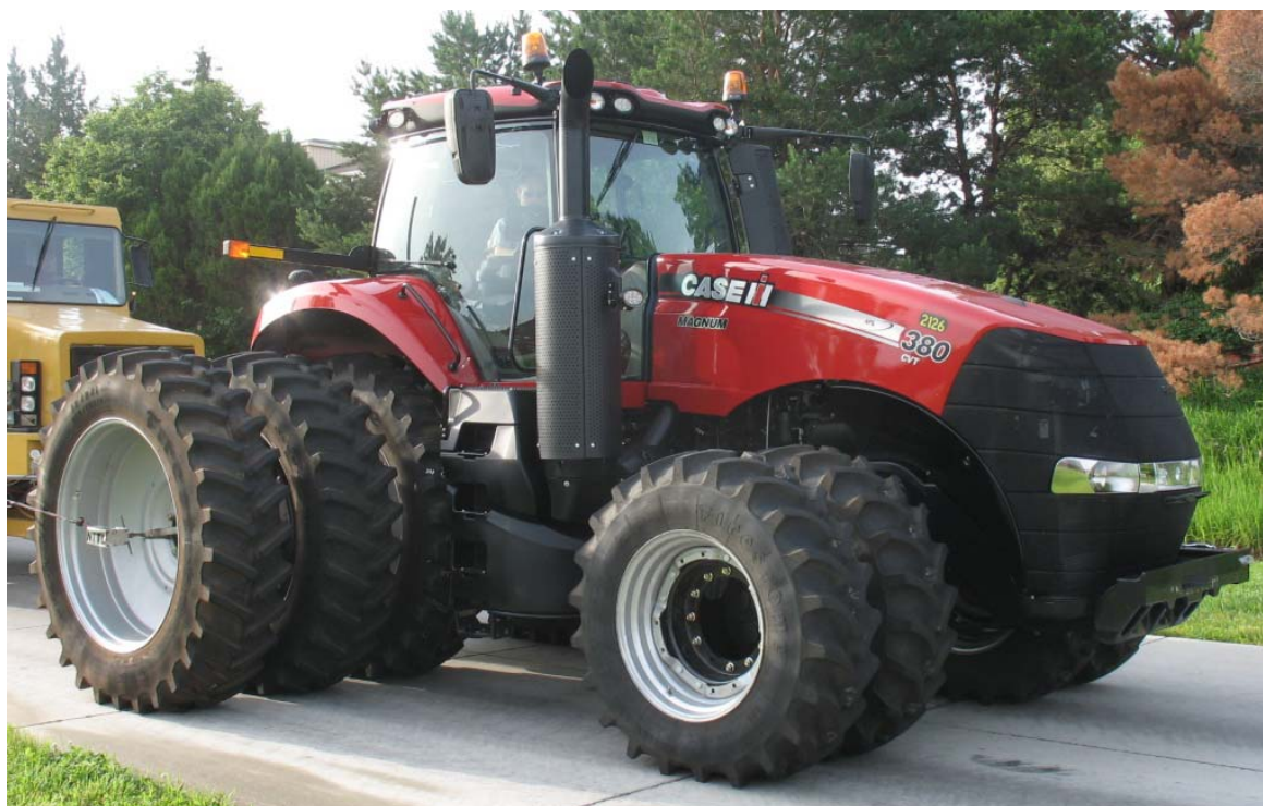
CASE IH MAGNUM 380 DIESEL