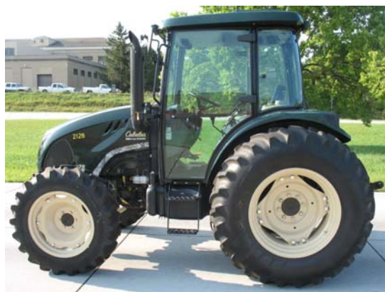
Cabela's LM75 Diesel

Institute of Agriculture and Natural Resources University of Nebraska–Lincoln