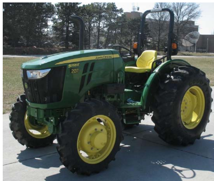
John Deere 5055E Diesel