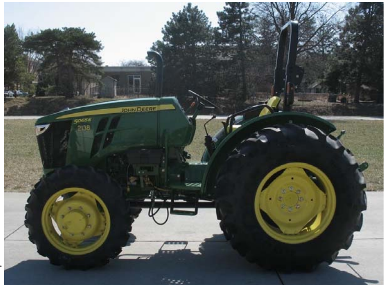
John Deere 5065E Diesel