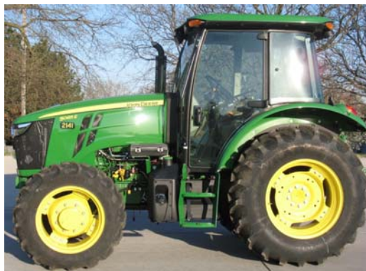
John Deere 5085E Diesel

Institute of Agriculture and Natural Resources University of Nebraska–Lincoln