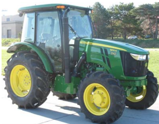
John Deere 5100E Diesel

Institute of Agriculture and Natural Resources University of Nebraska–Lincoln