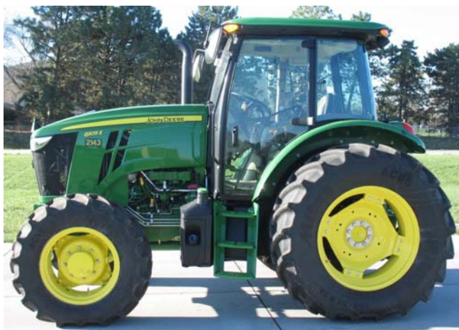
John Deere 6105E Diesel

Institute of Agriculture and Natural Resources University of Nebraska-Lincoln