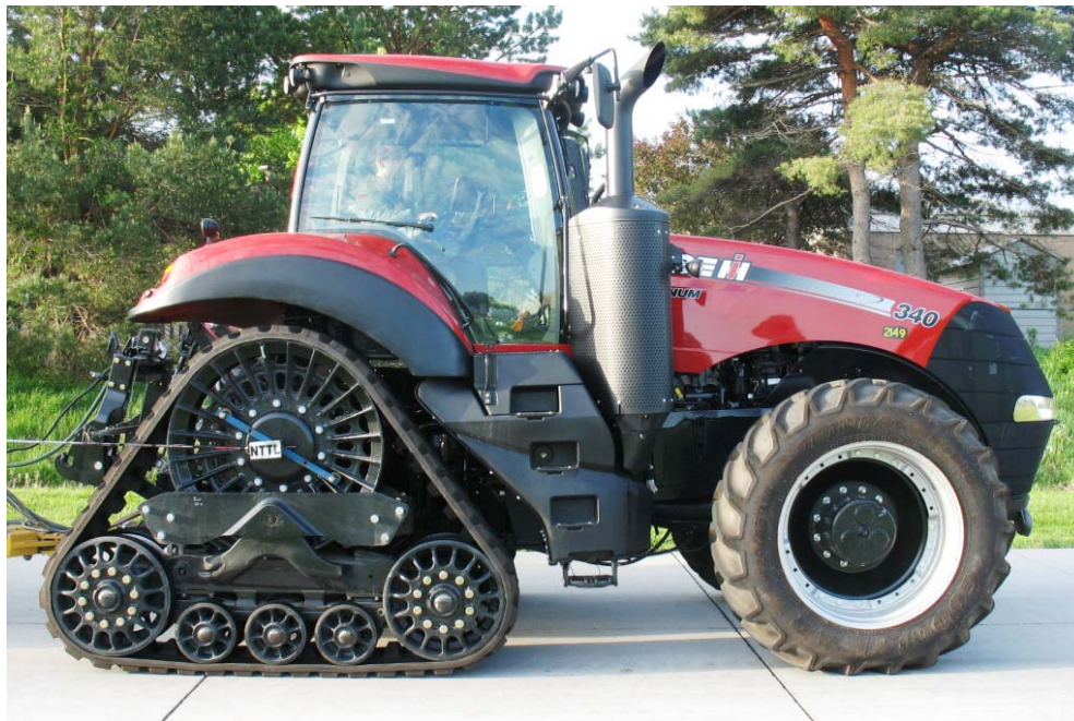
CASE IH MAGNUM 340 ROWTRAC DIESEL