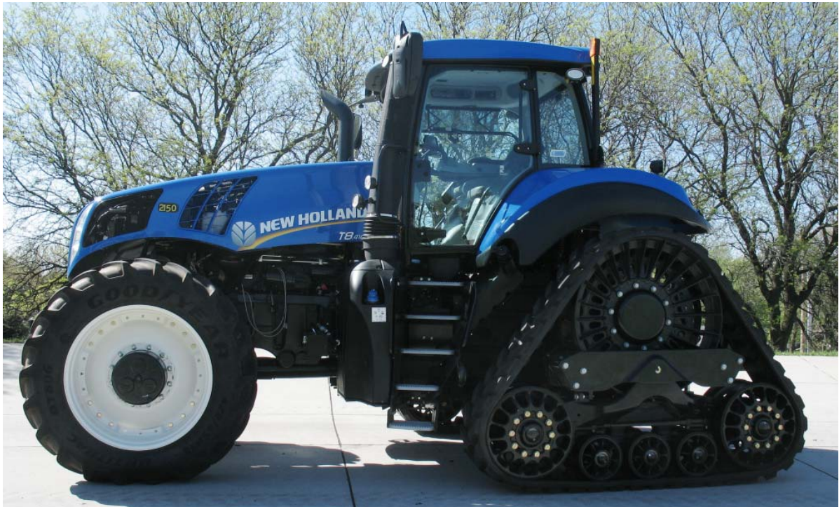
NEW HOLLAND T8.435 SMARTTRAX DIESEL