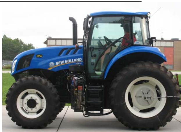
NEW HOLLAND TS6.110 DIESEL

Institute of Agriculture and Natural Resources University of Nebraska-Lincoln