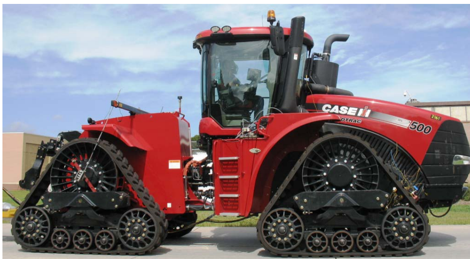
CASE IH 500 ROWTRAC Diesel

Institute of Agriculture and Natural Resources University of Nebraska-Lincoln