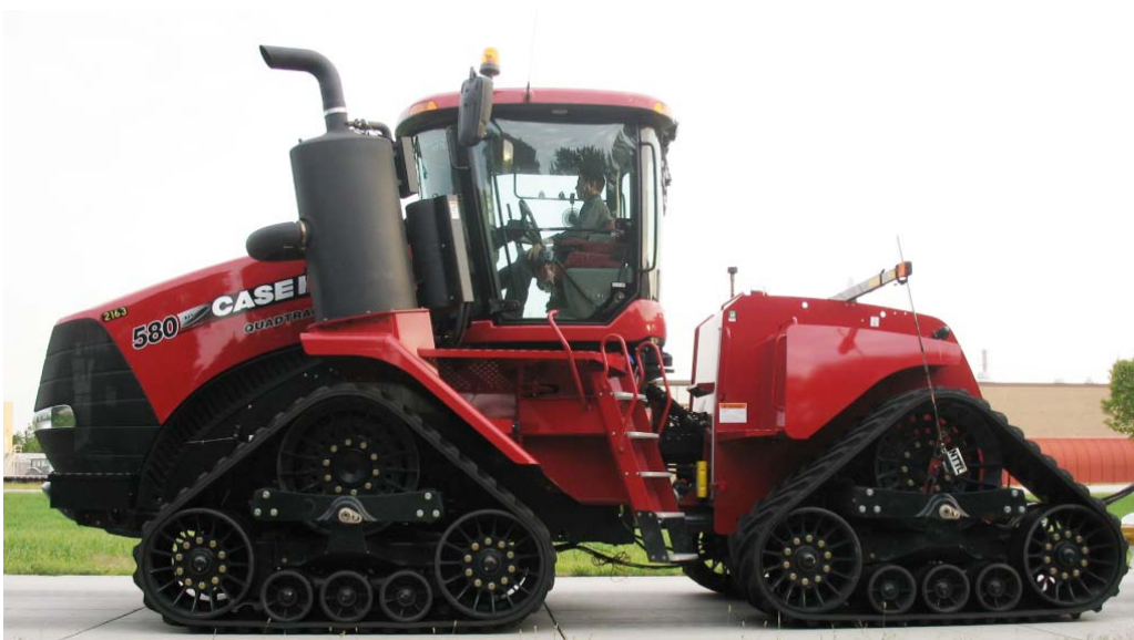
Case IH Steiger 580 Quadtrac Diesel

Institute of Agriculture and Natural Resources University of Nebraska-Lincoln