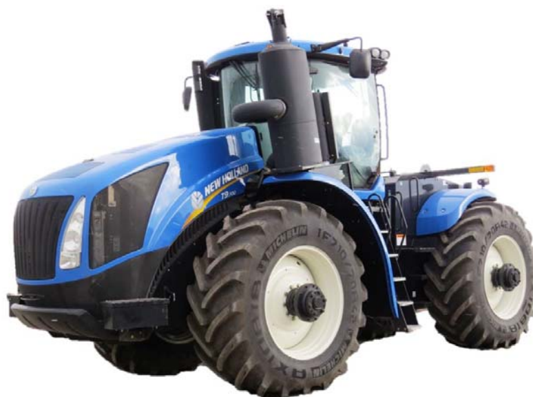
NEW HOLLAND T9.700 Diesel

Institute of Agriculture and Natural Resources University of Nebraska-Lincoln