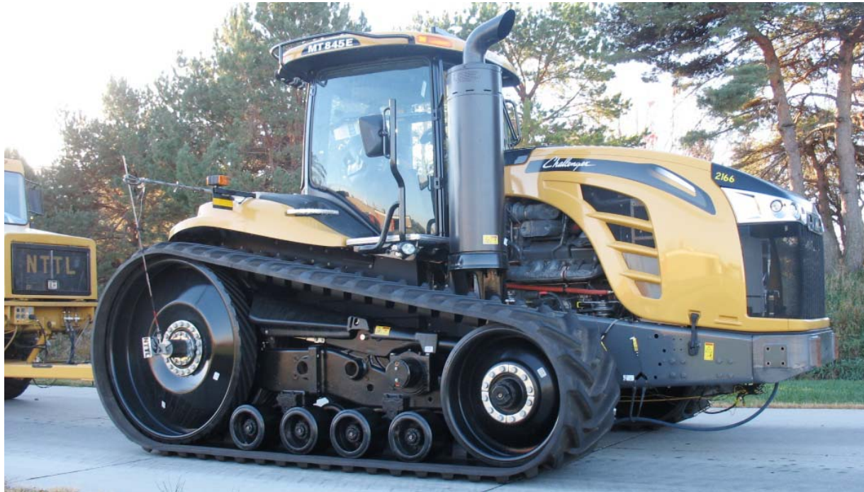
Challenger MT845E Diesel

Institute of Agriculture and Natural Resources University of Nebraska-Lincoln