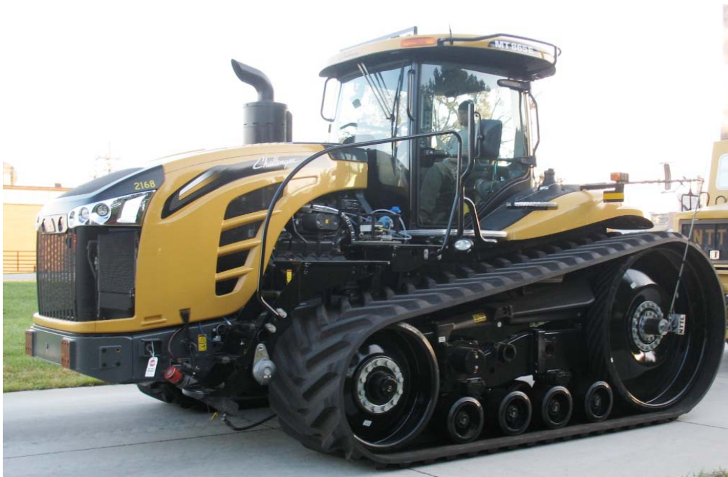
Challenger MT865E Diesel

Institute of Agriculture and Natural Resources University of Nebraska-Lincoln