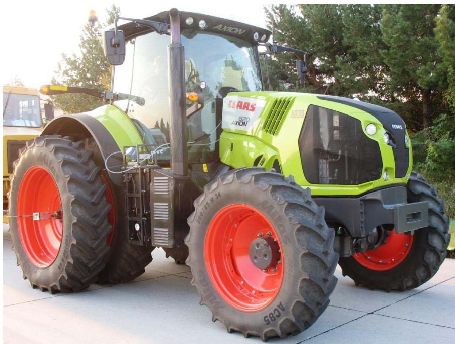
CLAAS AXION 820 DIESEL