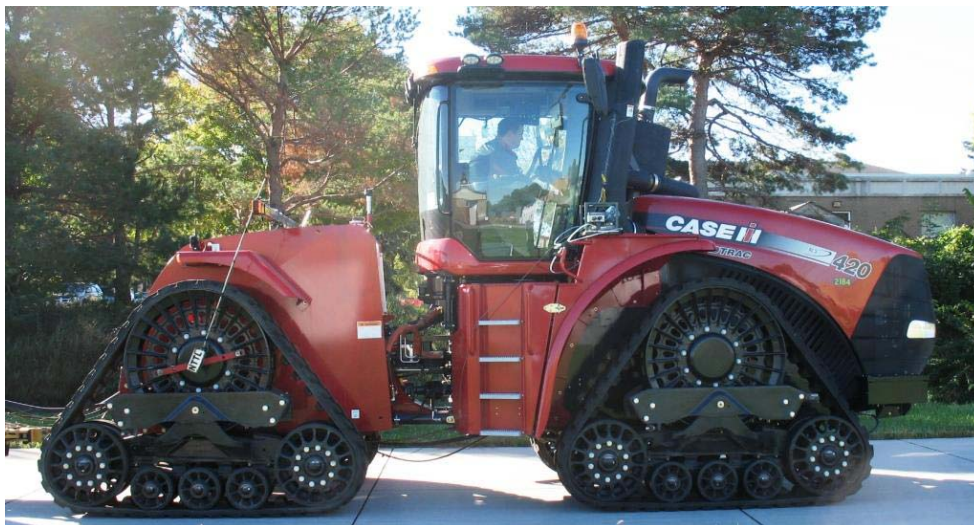
CASE IH 420 ROWTRAC Diesel

NTTL.(2017). Nebraska OECD tractor test 2184 for Case IH Steiger 420 Rowtrac Diesel. Lincoln, NE:Nebraska Tractor Test Laboratory. Retrieved from http://tractortestlab.unl.edu