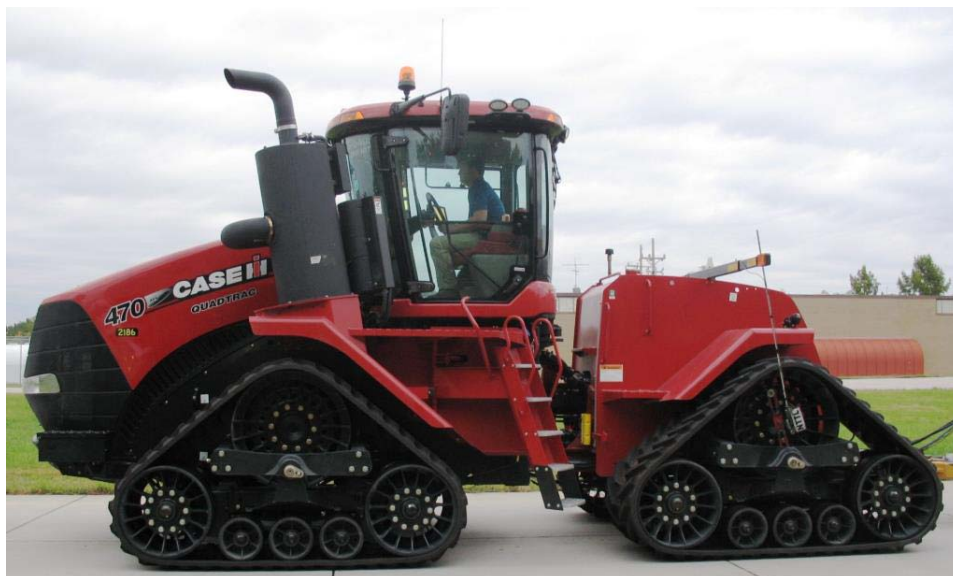
Case IH Steiger 470 Quadtrac Diesel

NTTL.(2017). Nebraska OECD tractor test 2186 for Case IH Steiger 470 Quadtrac Diesel. Lincoln, NE:Nebraska Tractor Test Laboratory. Retrieved from http://tractortestlab.unl.edu