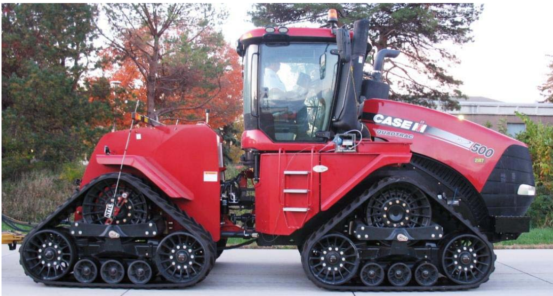
Case IH Steiger 500 Quadtrac Diesel

NTTL.(2017). Nebraska OECD tractor test 2187 for Case IH Steiger 500 Quadtrac Diesel. Lincoln, NE:Nebraska Tractor Test Laboratory. Retrieved from http://tractortestlab.unl.edu