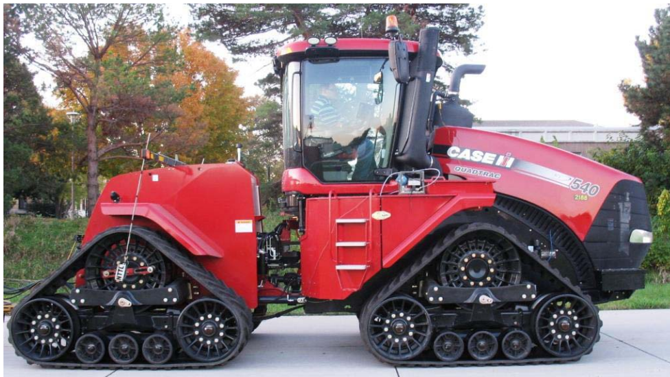
Case IH Steiger 540 Quadtrac Diesel

NTTL.(2017). Nebraska OECD tractor test 2188 for Case IH Steiger 540 Quadtrac Diesel. Lincoln, NE:Nebraska Tractor Test Laboratory. Retrieved from http://tractortestlab.unl.edu