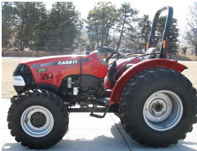
Case IH Farmall 50A Diesel

Lincoln, NE:Nebraska Tractor Test Laboratory. Retrieved from http://tractortestlab.unl.edu