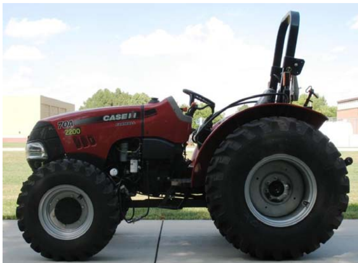
Case IH Farmall 70A Diesel

Lincoln, NE:Nebraska Tractor Test Laboratory. Retrieved from http://tractortestlab.unl.edu