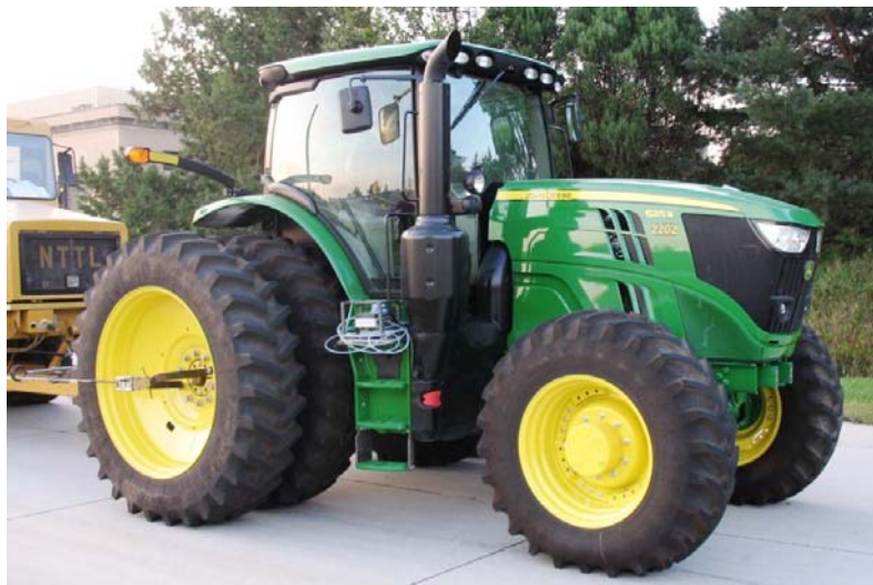
JOHN DEERE 6215R DIESEL

Lincoln, NE:Nebraska Tractor Test Laboratory. Retrieved from http://tractortestlab.unl.edu