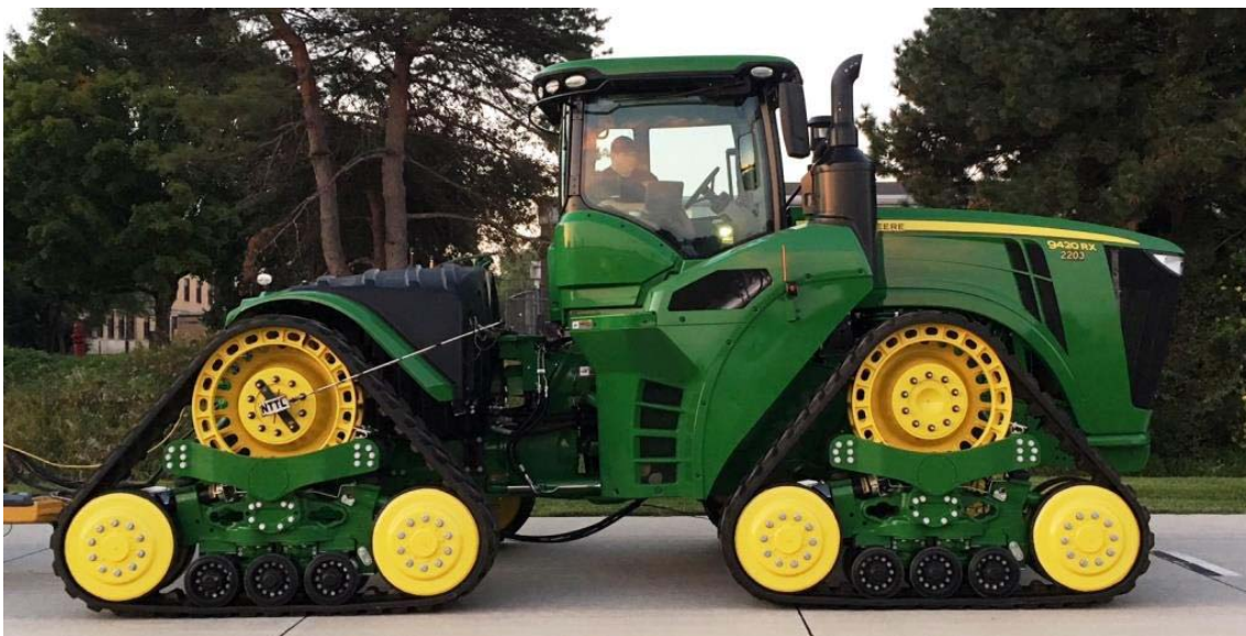
JOHN DEERE 9420RX DIESEL

NTTL.(2018). Nebraska OECD Tractor test 2203 for John Deere 9420RX Diesel. Lincoln, NE:Nebraska Tractor Test Laboratory. Retrieved from http://tractortestlab.unl.edu