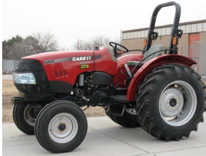
Case IH Farmall 60A Diesel

Lincoln, NE:Nebraska Tractor Test Laboratory. Retrieved from http://tractortestlab.unl.edu