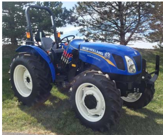
New Holland Workmaster 60 Diesel (FWA model shown was not tested)

NTTL.(2019). Nebraska Tractor test 2208A for New Holland Workmaster 60 Diesel. Lincoln, NE:Nebraska Tractor Test Laboratory. Retrieved from http://tractortestlab.unl.edu