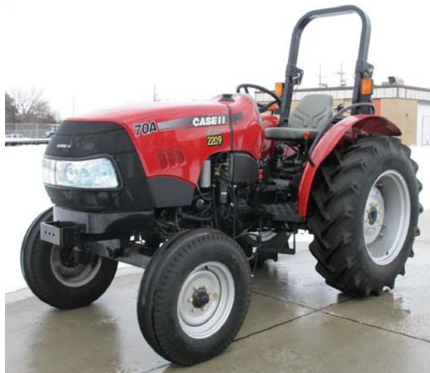
Case IH Farmall 70A Diesel

Lincoln, NE:Nebraska Tractor Test Laboratory. Retrieved from http://tractortestlab.unl.edu