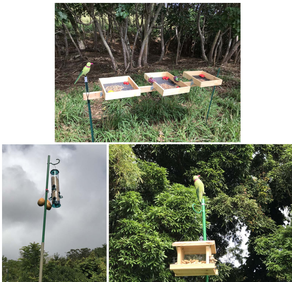
FIGURE 2. Feeders tested on Kaua'i. Platform feeders with decoy parakeet and fruits in cattle pasture, Kaua'i, Hawai'i, USA, February 2020 (top). Tube feeder with decoy fruits and commercial bird seed mix in tropical fruit farm (bottom left), and house-style hopper feeder with decoy parakeet and whole peanuts in tropical fruit farm, Kaua'i, Hawai'i, USA, October 2020 (bottom right).

A tube feeder (Stokes Select Jumbo Seed Songbird Tube Feeder, Classic Brands, Denver, CO, USA) was baited with the same commercial bird seed used in the platform feeder trial. A hopper feeder (Large Ranch Wild Bird 5lb Cedar Combo Seed & Suet Bird Feeder, National Audubon Society, Manhattan, NY, USA) was baited with whole peanuts. Both feeders were elevated to a height of ~3.3 m using metal electrical conduit. We painted the conduit brown and green to better replicate vegetation and