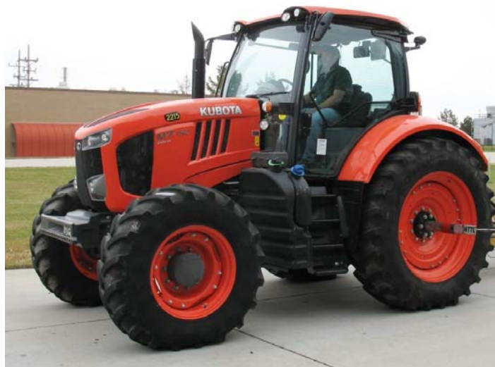
KUBOTA M7-152 DIESEL