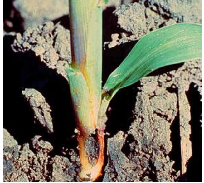
Figure 4. Cutting at the base of corn plant by black cutworms.

Economic thresholds have not been researched for this insect, but use of thresholds similar to those for cutworms has been suggested. The same insecticides labeled for post-emergence use against cutworms would be appropriate for southern corn leaf beetles.