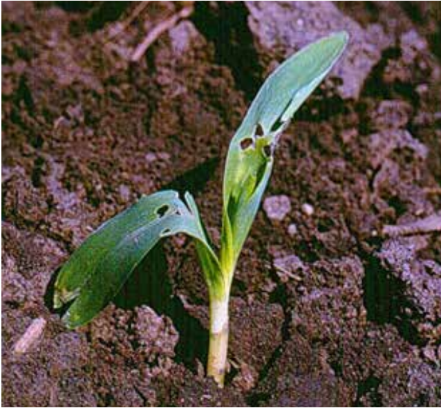
Figure 3. Leaf feeding by small black cutworms on corn.