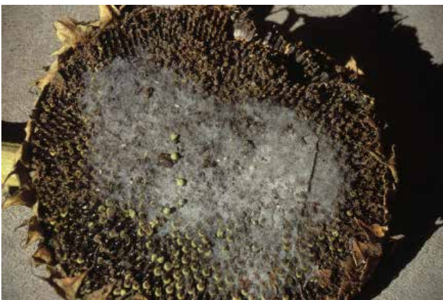
Figure 4. Grayish, fuzzy fungal growth on flower side of head.

infected, it can allow the head to fall completely off, increasing the potential for severe yield loss.