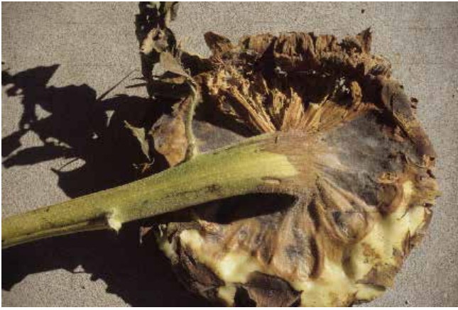
Figure 2. Advanced stage of disease showing both watery soft rot and dried, shredded tissues.