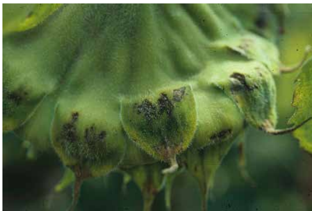
Figure 1. Early lesions of Rhizopus spp. forming on the back of sunflower heads.

Diseases affecting sunflowers include those caused by fungi, bacteria, viruses, and nematodes. However, most common diseases affecting sunflowers in this region are caused by fungi and are generally more severe in irrigated production.