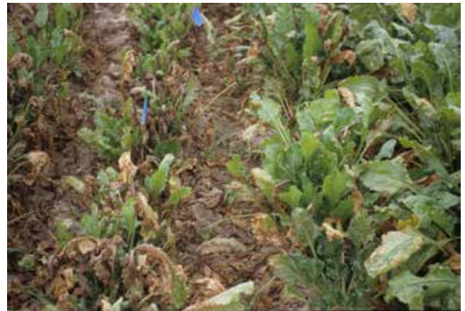
Figure 9. Benefits of genetic resistance to the pathogen after a severe CLS epidemic. Plants at left are susceptible and those at right are tolerant.

1 was three while on Day 2 it was four. The sum of these two days was seven, resulting in conditions that would favor infection. If no symptoms were observed on leaves, then the DIV sum indicates that careful scouting is advised; if symptoms were present, a fungicide application would be warranted. If on Day 3, there were 12 hours of leaf wetness and the temperature during this period was 62°F, then the DIV sum for Days 2 and 3 is 4+0=4 , and no action would be necessary.