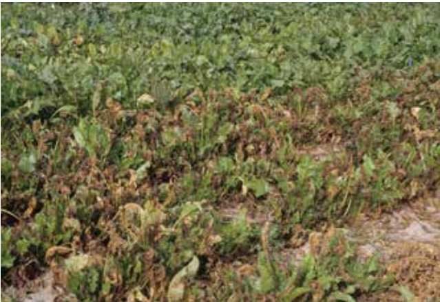
Figure 8. Severe infection from a distance, giving plants the appearance of being burned.