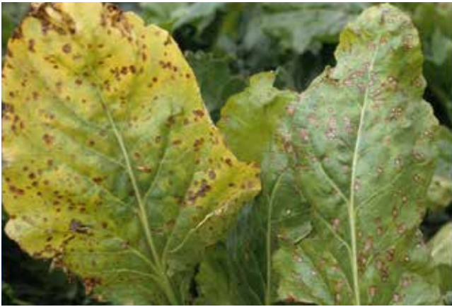
Figure 6. Cercospora -infected leaves. Leaf at left is beginning to yellow and die.