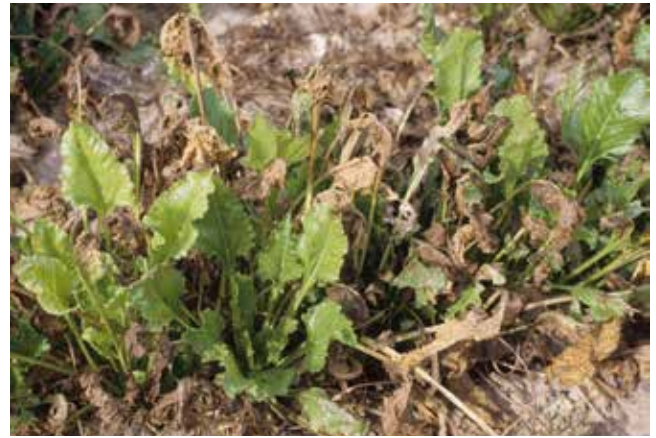
Figure 7. Severe infection with multiple leaves completely dead and covered with masses of coalesced lesions. New growth emerging is unaffected.