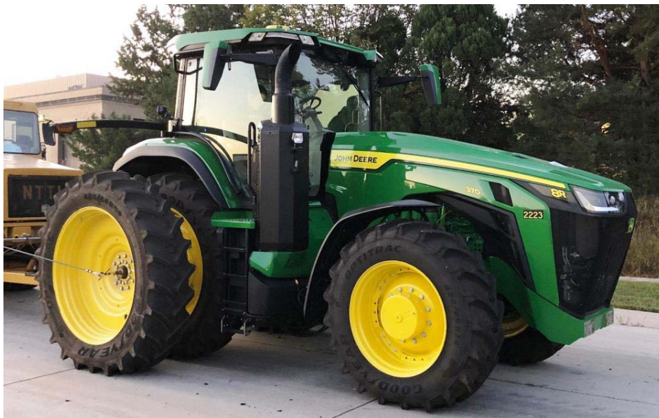
JOHN DEERE 8R 370 DIESEL

NTTL.(2021). Nebraska OECD tractor test 2223 for John Deere 8R 370 IVT Diesel. Lincoln, NE:Nebraska Tractor Test Laboratory. Retrieved from http://tractortestlab.unl.edu