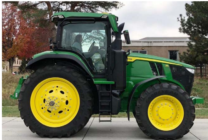
JOHN DEERE 7R 210 DIESEL Institute of Agriculture and Natural Resources University of Nebraska–Lincoln

NTTL.(2021). Nebraska OECD tractor test 2179A for John Deere 7R 210 e23 Diesel. Lincoln, NE:Nebraska Tractor Test Laboratory. Retrieved from http://tractortestlab.unl.edu