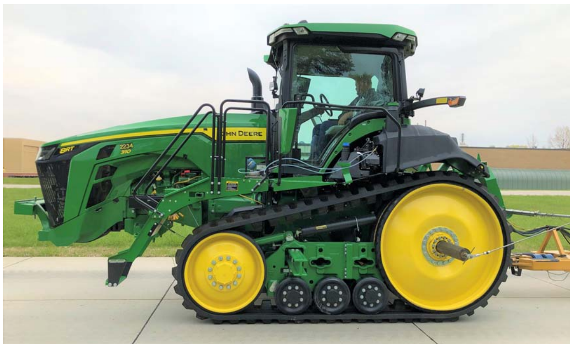
JOHN DEERE 8RT 310 DIESEL Institute of Agriculture and Natural Resources University of Nebraska-Lincoln

NTTL.(2021). Nebraska OECD tractor test 2234 for John Deere 8RT 310 e23 Diesel. Lincoln, NE:Nebraska Tractor Test Laboratory. Retrieved from http://tractortestlab.unl.edu