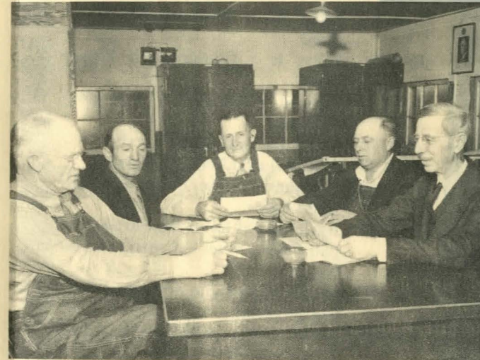
A Soil and Water Conservation District Board of Supervisors meeting to discuss problems and plans.