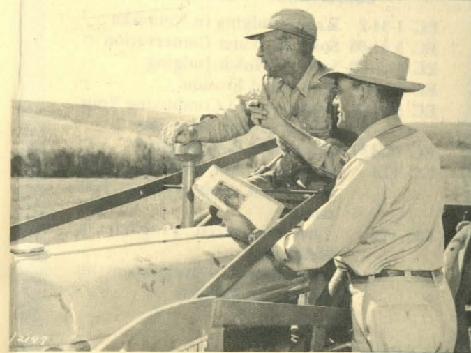
Soil Conservation Service technician explaining a conservation plan to a farmer.

A Watershed Conservancy District is a sub-district of one or more existing soil and water conservation districts. It provides legal authority to resident taxpayers to meet local responsibilities in carrying out a Watershed Protection and Flood Prevention program.