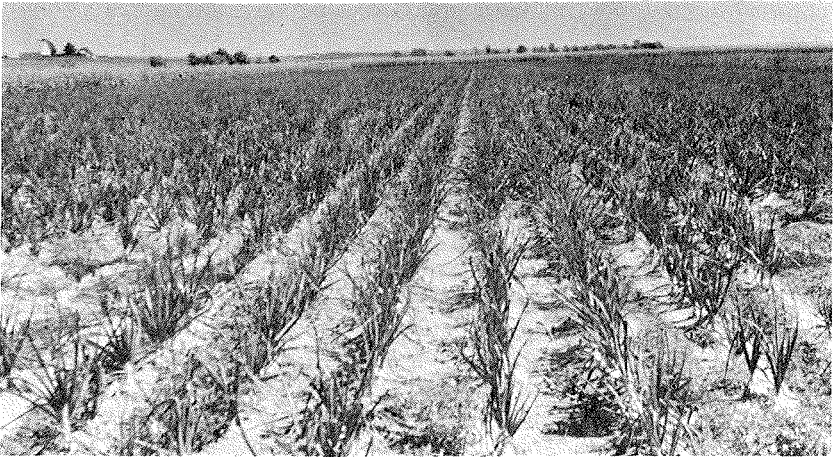
Clean onion fields can be obtained with the use of herbicides.