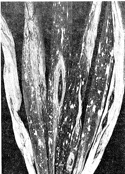
Purple blotch symptoms on onion foliage.

A good spreader-sticker is recommended; this is usually indicated on the manufacturer's label. An insecticide could be added in the early and mid-season sprays.