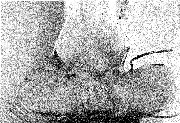
Figure 1. Base of a disease plant showing a brownish discoloration of the core of the old corm and newly developing corm.

3. Rotation : Rotate the planting so that this disease organism does not build up in the soil. If it is not possible to rotate and fusarium yellows begins to be a problem, treat the soil with Vapam or methyl bromide in fall or early spring before planting. Instructions on the application of Vapam or methyl bromide are on the container or instruction sheet furnished with the product.