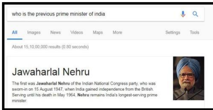
Figure 1: Misleading information provided by a popular search engine.

internet search engines mostly answer queries by matching the keywords but a librarian tries to understand the right semantics of a query and only then he refers the right data and information. Further, a Librarian can also provide referral service, if required. Though, promises of semantic web are high, there is a long way to go. A classic proof of the dumbness of the internet has been provided in Figure 1 [3].