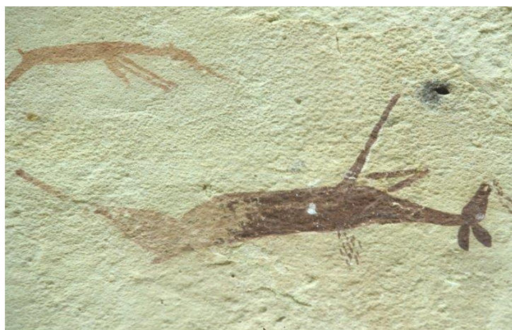
“Bleeding antelopes” from the eastern Free State of South Africa.

external resources as well. Most of these items are downloadable in the different formats including tiffs for the images, pdf for manuscripts and books, mpeg and mp3 for video and audio respectively. The collection includes many unique and ancient artifacts and the oldest items like “an 8000 years old painting of bleeding antelopes” dating back to BCE 1. Some items in the collections also include curators’ videos, in which curators explain the importance of certain items and discuss these materials in a scholarly fashion ( Murillo, 2010 ).