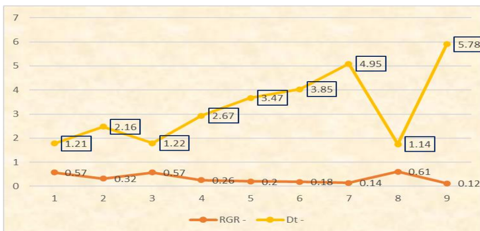
Graph 2: Relative growth rate and double time of publication