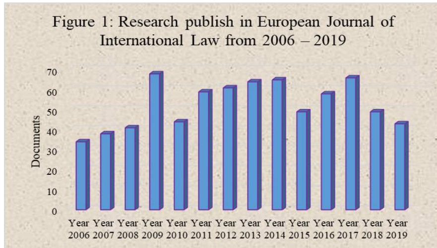
Table 1: Research productivity published in the European Journal of International Law for the period 2006 – 2019.