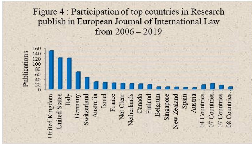
Table 5: Participation of top countries in Research publish in European Journal of International Law from 2006 – 2019

articles. Eight countries; Chile, Hong Kong, Iceland, Jamaica, Latvia, Mexico, Poland, and Serbia added one paper.