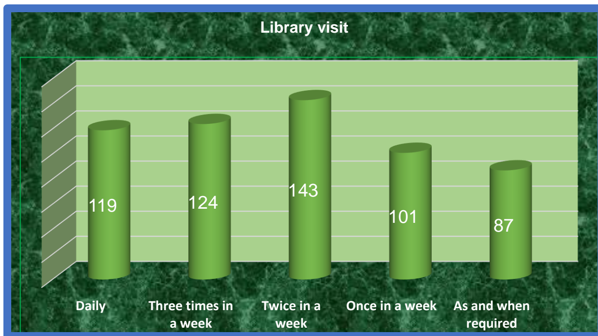
Table 3 Purpose of utilization