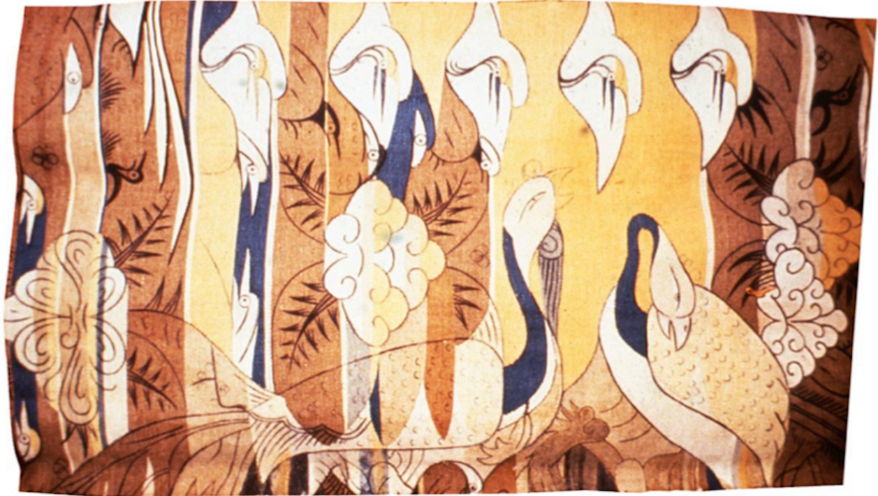
Figure 1. Ink Painted Wool Tapestry Mantle, Northwest China Yuan-Ming Dynasty. Permission: Gion Matsuri Yamaboko Rengokai. Image by Yuge Sei. 158 x 85 cm.

This wool mantle ( fig. 1 ) was woven by Monguors, a Chinese minority living along the Yellow River, during the Yuan and Ming Dynasties (1279-1368 and 1368-1644) in Gansu Province, China. The Monguors practiced a religion called Manichaeism after its founder Mani, who was born in Babylonia and lived in third century Persia. The Manichaeans believe that the universe is divided between the forces of Good, exemplified by Light and the forces of Evil, demonstrated by Dark. 1 The duty of the Manichaean is to increase and protect Light. The faith is sometimes called "The Religion of Light" and several of their artworks exhibit a luminous quality. The two forces are thought to have engaged in a continuous struggle for dominance. The vertical segments of light and dark backgrounds on all the tapestries illustrate this duality. The peacocks pictured in the foreground are perceived as guardians against evil, due to their their proclivity for killing snakes in gardens.