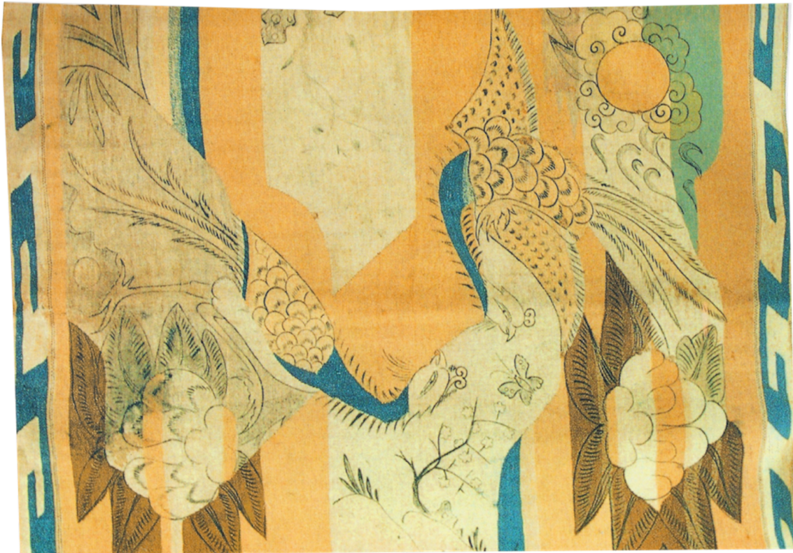
Figure 2. Ink Painted Wool Tapestry Mantle, Northwest China Yuan-Ming Dynasty. Permission: Gion Matsuri Yamaboko Rengokai. Image by Yuge Sei. 158 x 85 cm.

The peacock image, usually shown in pairs, appears in a variety of formats. Other Manichaean images, including branches of The Tree of Life, and also the Sun, perceived as a Deity by Manichaeans, are prominent. Peonies, implying abundance, surrounding the sun, are included to appeal to the Mongols, rulers of China during this period, who favored this image. The Sun Deity is surrounded by a Manichaean motif known in China as The Curly Grass Motif. This motif is seen on Monguor tapestries, on costume, on architecture, and on carpets. The apricot colored ground, characteristic of most of the tapestries, was originally the bright red-orange obtained from safflower dye. Tapestry weave with single dovetailing was employed to create the mantles (the adjacent colors of weft yarns turn on a single warp). Curvilinear forms resulted from the insertion of extra wefts, a technique called “eccentric weave.” Details and outlines were added with pen and black ink painted directly on the wool surface.