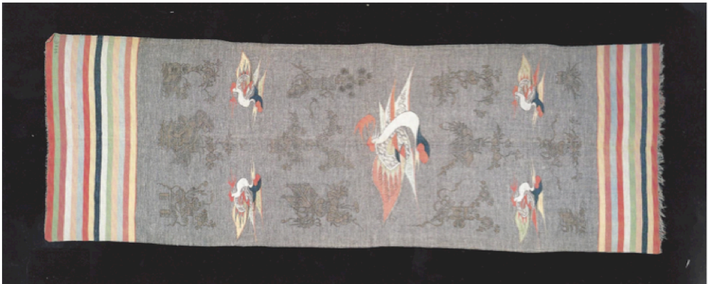
Figure 7. Ink painted wool tapestry mantle, Southern Coastal China, nineteenth century. Private Collection, Image ©Fowler Museum at UCLA, photography by Don Cole. Warps: cotton, S spun 4 yarns, Z plied. Wefts:, Z spun wool, 2 yarns, S plied, mixed with some fragile sharp fibers. 337 x 118 cm.