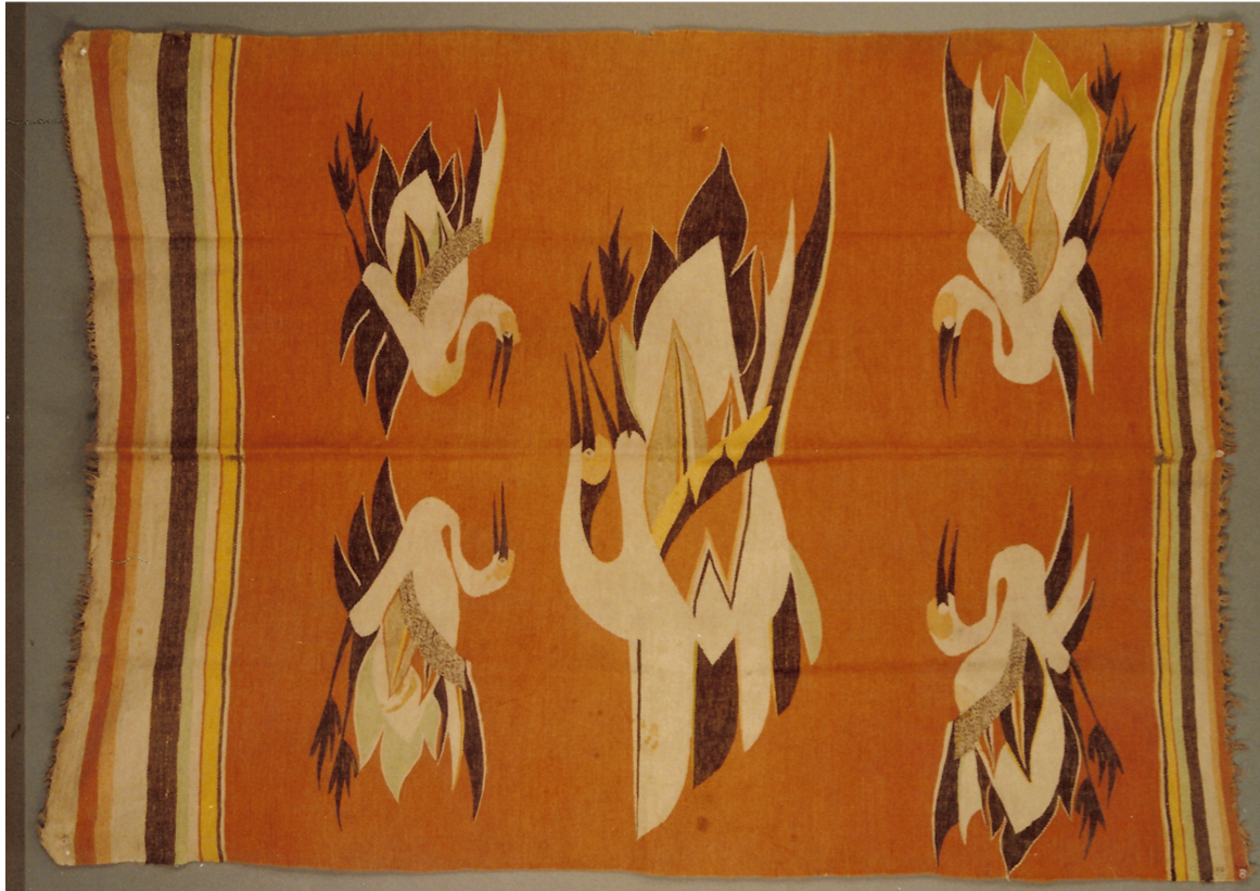
Figure 6. Ink painted wool tapestry mantle. Southeast coastal China, eighteenth century. Private Collection, Image ©Fowler Museum at UCLA, photography by Don Cole. Five cranes motif. 68 x 53 cm.