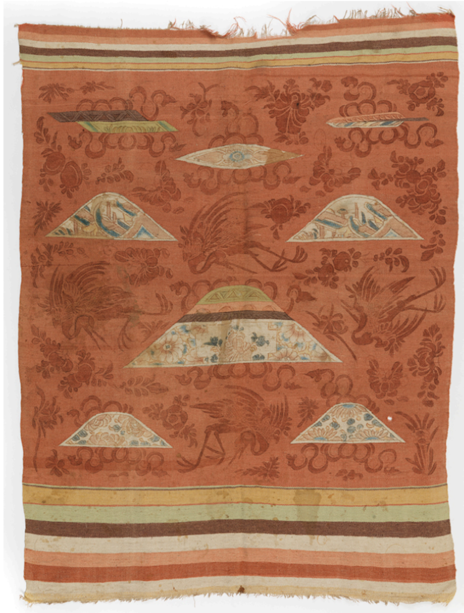
Figure 8. Block-printed and tapestry woven wool mantle, nineteenth century. Private Collection, Image ©Fowler Museum at UCLA, photography by Don Cole. The theme is Mt. Meru, sacred to Taoists, surrounded by flying cranes, thought to be conveyances of the Taoist Immortals. The mountains are wood-block printed with multicolored inks. 171 x 130 cm.

The Taoist themes on the wood block printed and tapestry-woven mantle illustrated below ( fig. 7 ), was created on the southeast China coast, of coarse and hairy wool. Included are the cranes, symbolizing longevity, and the plants in flower vases on the grey ground, emblems of harmony. The rainbow stripes at each end indicate closures, used when the mantle is wrapped around the body, and also honor elements of Nature. Safflower red dye appears, now used sparingly. The layout of the five cranes indicates this tapestry, although fairly heavy weight, was designed to be worn as costume, the largest crane placed at the center of the wearer's back.