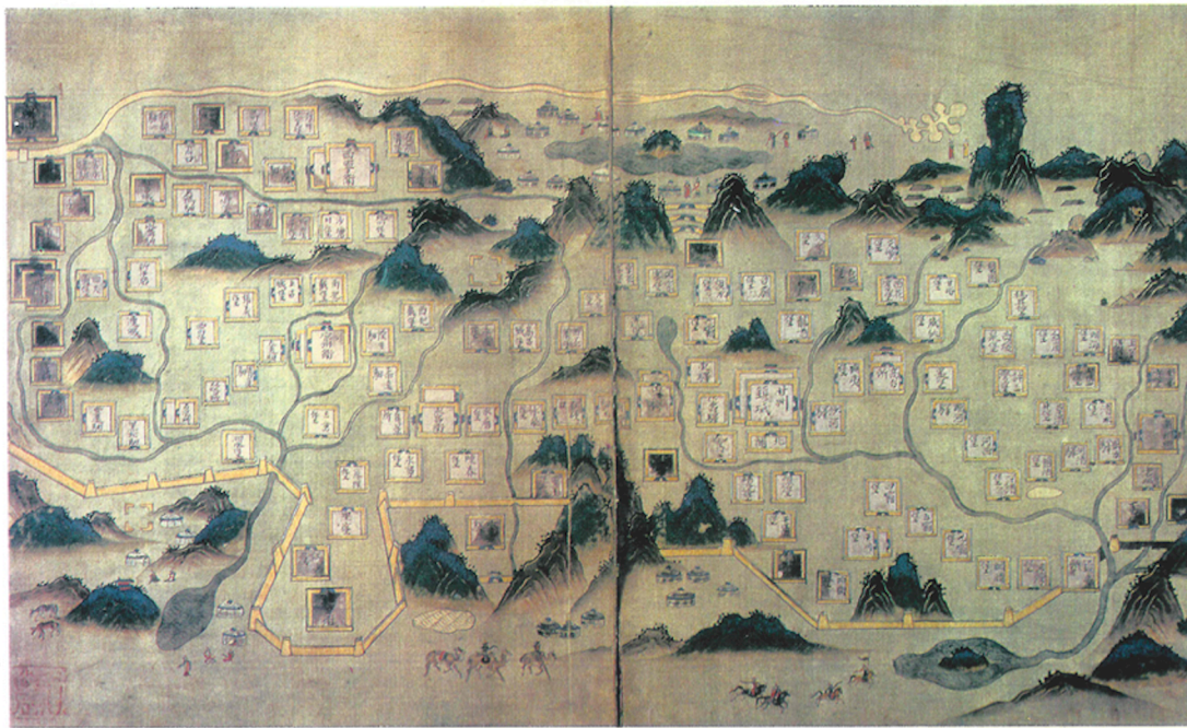
56. 西宁卫 Xi Ning Wei (Xining Garrison)