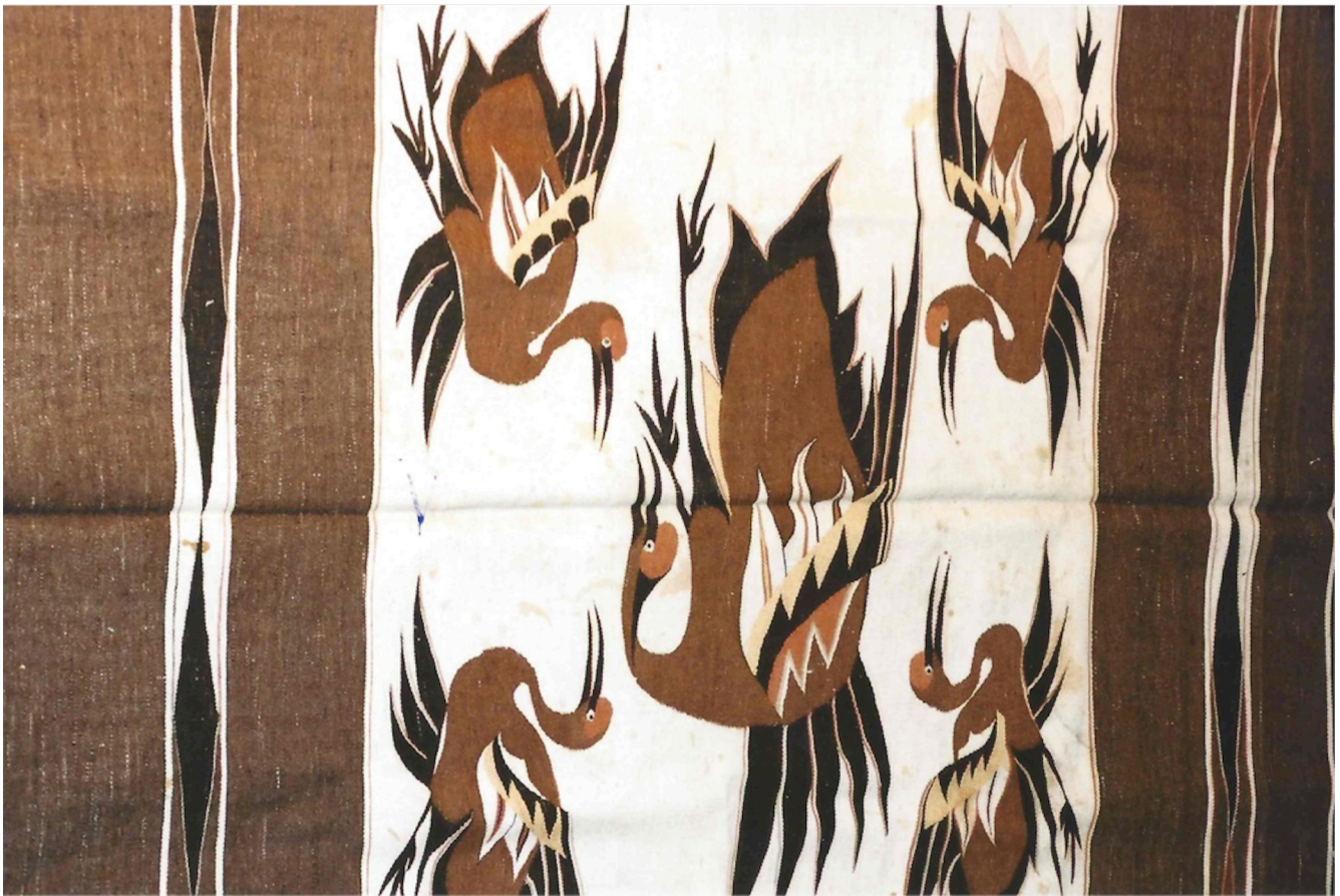
Figure 5. Tapestry woven and block printed wool mantle. Southeast China Coastal region. Private Collection, Image ©Fowler Museum at UCLA, photography by Don Cole. When this mantle is wrapped around the body, the crane emblem appears at the center back of the wearer. 170.8 x 120.7 cm.

When the Monguor fled south they continued to weave mantles. They were forced to use the coarse wool of marshland sheep as the soft fiber of the mountain sheep was no longer available. On this mantle the large crane in the center as well as the two smaller cranes on each side project a somewhat ominous look, with menacing sharp beaks and claws. Perhaps the cranes with their very sharp scissor-like beaks was a means of incorporating the protective role of the former peacock, now replaced by the crane of the Taoists. The Manichaean settlements were facing an increasing menace from the Chinese Taoist majority surrounding the communities in South China. 4