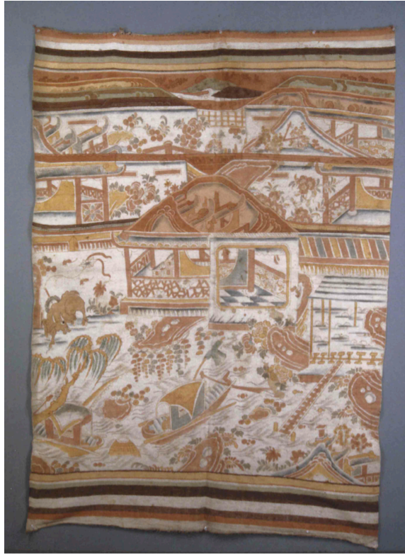
Figure 10. Tapestry woven and wood block printed example depicting the port of Suzhou and its many gardens and canals as “The Pure Land,” nineteenth century. The tapestries became popular with Yangtze boatmen. Private Collection 160 x 120 cm.