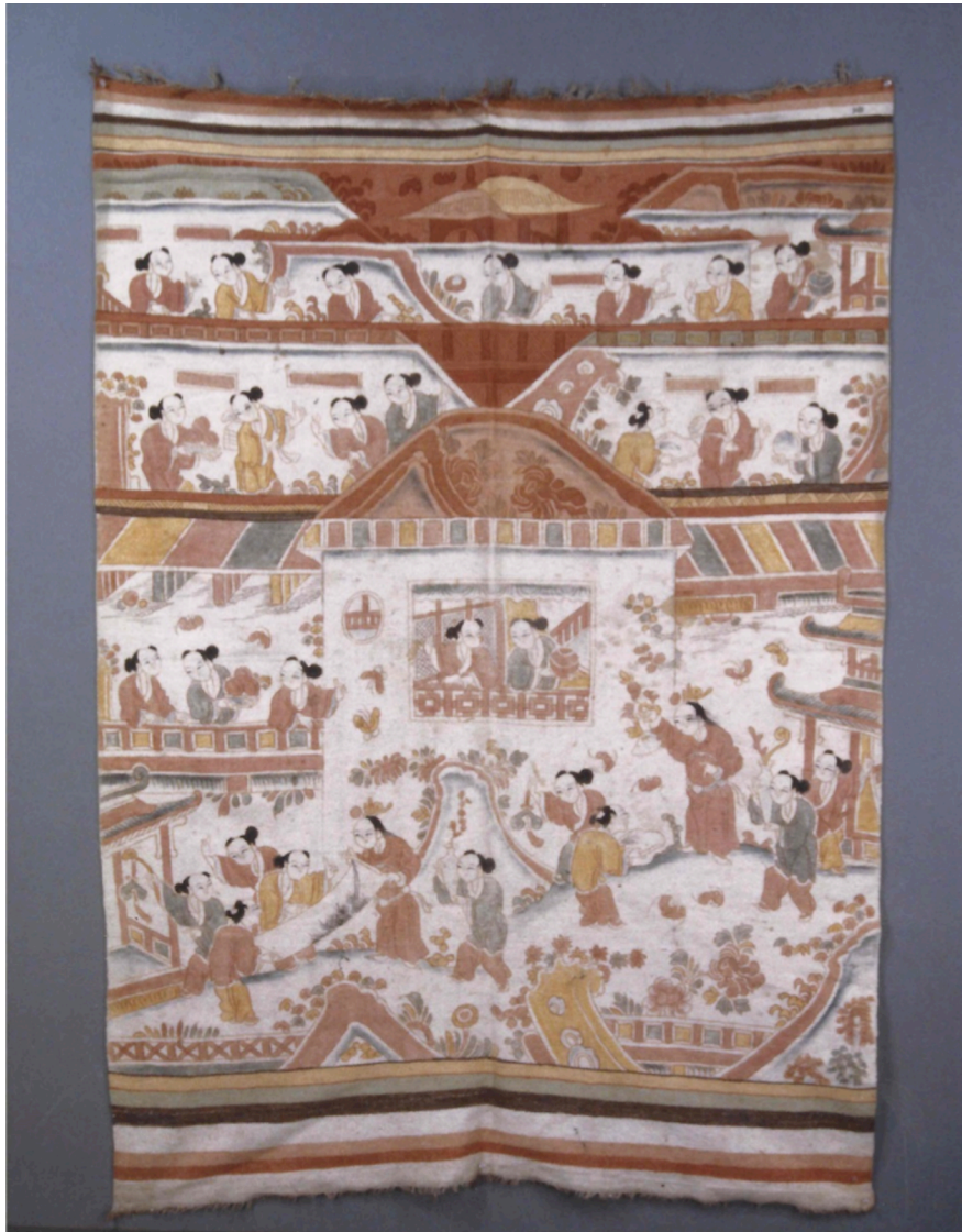
Figure 9. Painted and Printed Wool Tapestry from Suzhou, Jiangsu Province, nineteenth century. Private Collection, 160 x 120 cm. The tapestries are now presented vertically and are used as hangings and carpets by tourists and foreigners.

The above tapestry (fig. 9) depicts a conception of The Pure Land. 5 Buddhas, Bodhisattvas, and deities are thought to inhabit a Pure Land, a far away paradise where the devout may be reborn and continue on their path to Enlightenment. Block printed with ink-painting on "the maidens" hair buns. The border stripes have become diminished in size. This block printed example depicts the port of Suzhou and its many gardens and canals as "The Pure Land." 6 The tapestries became popular with Yangtze boatmen, who used the water resistant mantles to cover their boat canopies.