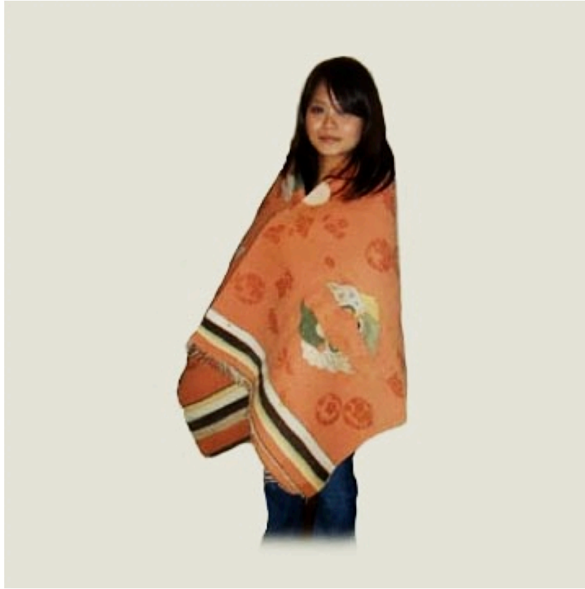
Figure 12: The eighteenth-nineteenth century tapestry is modeled here by a young woman who demonstrates the traditional mode of wearing a Monguor decorated mantle. Private Collection, Image ©Fowler Museum at UCLA, photograph by author.