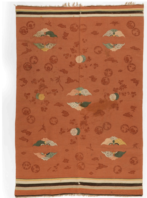
Figure 11: This oversized eighteenth to nineteenth century tapestry, was likely a custom order woven for a Chinese or a Chinese assimilated client. The butterflies and disks are beneficent motifs used by the Chinese population. Private Collection, Image ©Fowler Museum at UCLA, photography by Don Cole. 186 x 125 cm.