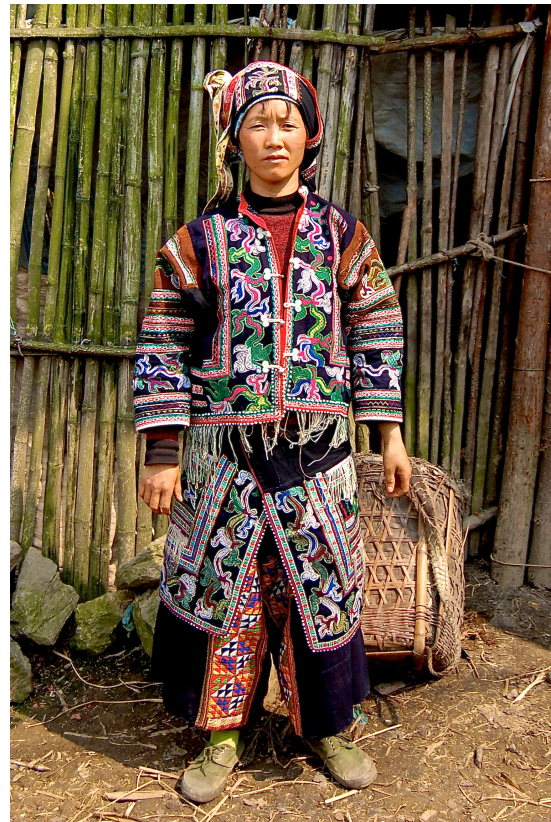
Figure 6 (left). Flowery Lolo in China. This outfit is similar in garment shapes to the Vietnamese Flowery Lolo outfit in Fig. 4. The decorative motifs on the outfits of this Flowery Lolo village are a combination of geometric shapes, stars, and arabesque forms. (Lee, 2010)