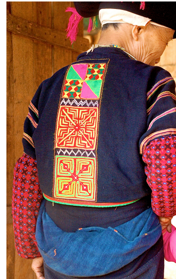
Figure 2 (left). Black Lolo women's jackets feature a center back panel with embroidered and applique motifs, and sleeves with colorful bands and stripes. The large gusset panels extending from under the arm to the waist is a common feature of all the jackets/tops of the various Lolo/Yi groups in this paper. (Lee, 2006)