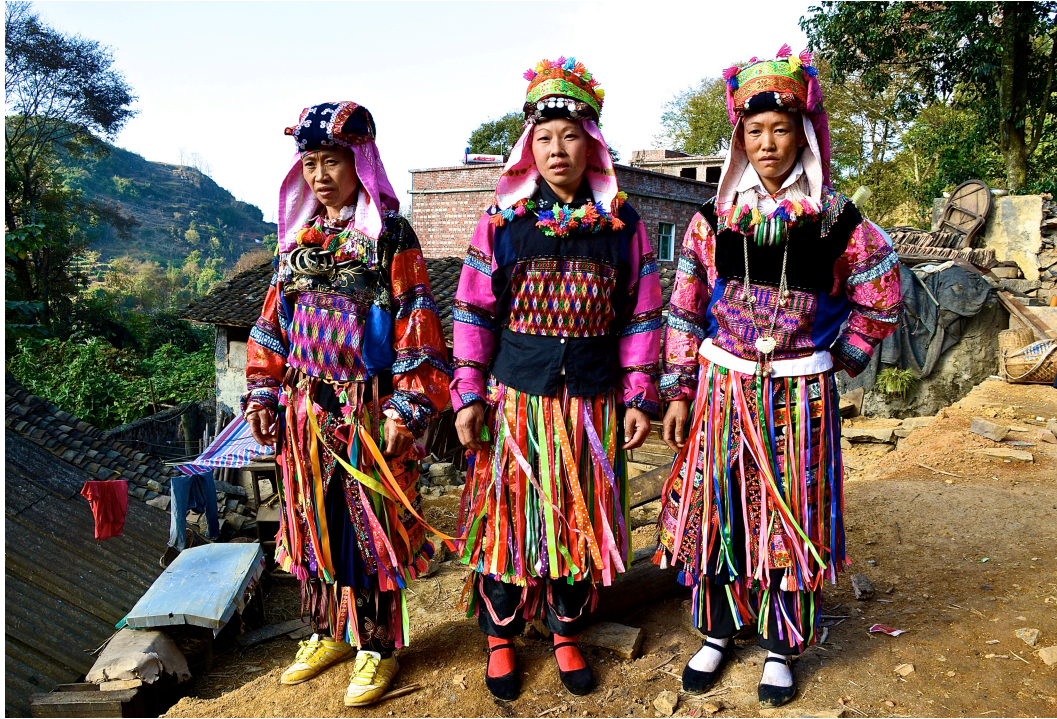
Fig. 8. Flowery Yi in Malipo area, Yunnan, China. This ethnic dress is worn by women of several villages in China and of at least one village in Vietnam. Different names have been attributed to this group. However, similarities in their ethnic dress clearly signify their kinship to one another and highlight the important role ethnic dress plays in cultural preservation. (Lee, 2012)