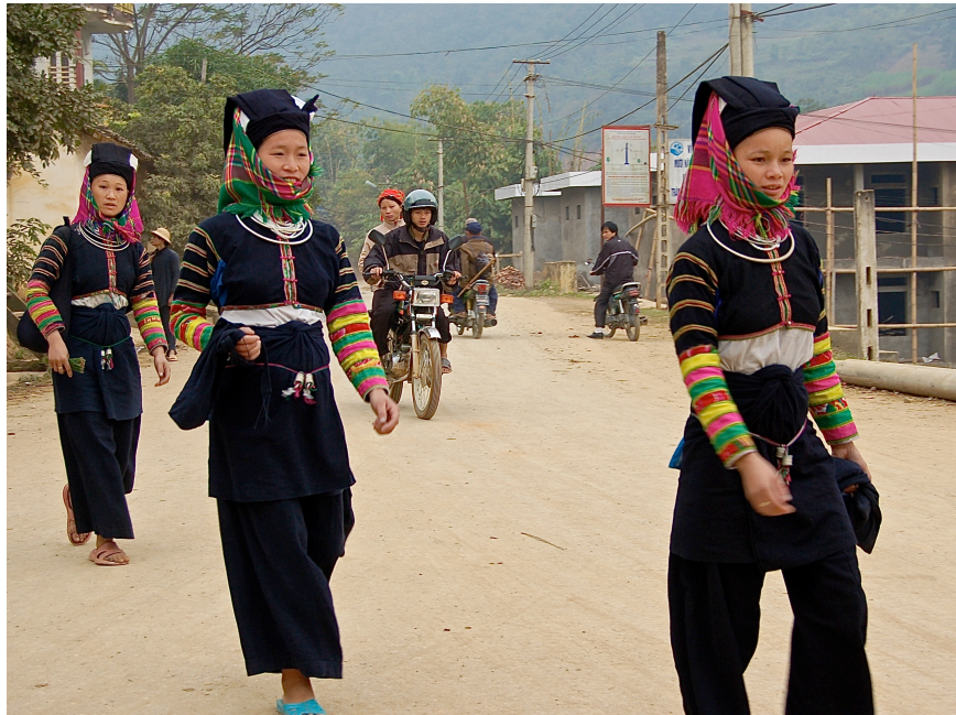
Figure 1. In remote northern Vietnam, Black Lolo women walk to their local market, dressed in their best ethnic garb. Although modern conveniences such as motorcycles, cell phones, and industrially produced cosmopolitan style garments are available, the Black Lolo continue to handcraft and wear their distinctive group dress daily. Identical ethnic dress worn across the border in China reveals clan connections otherwise difficult to discern. (Lee, 2006)