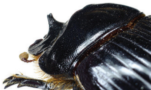
Figures 1–4. Copris felschei Reitter, 1892. 1) Habitus of male (IR-Esfahān prov., Fereydūnshahr). 2) Habitus of female (IR-Esfahān prov., Fereydūnshahr). 3) Head and pronotum of more developed male, posterolateral view (IR-Esfahān prov., Fereydūnshahr). 4) Head and pronotum of less developed male, posterolateral view (IR-Mazandaran prov., 6 km W of Reine, 2600 m).