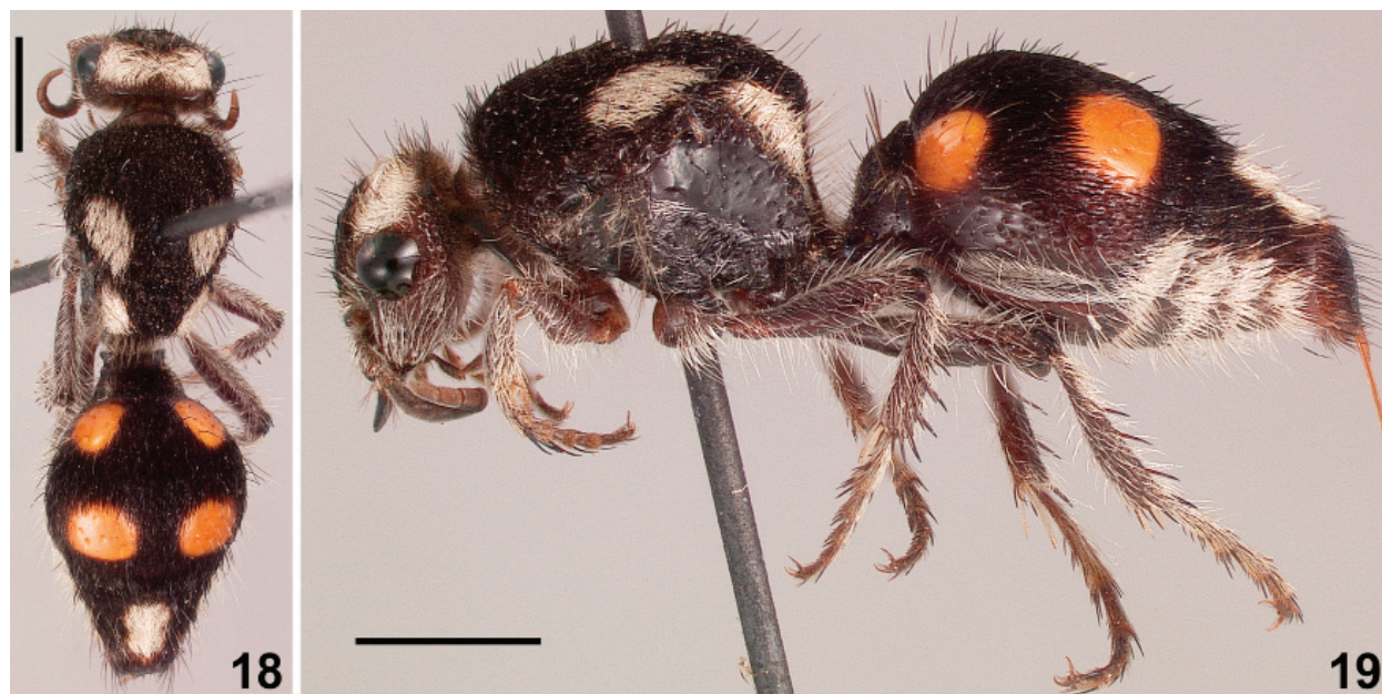
Figures 18–19. Traumatomutilla americana (Linnaeus, 1758). 18) Habitus, dorsal view. 19) Habitus, lateral view. Scale bar: 2 mm.