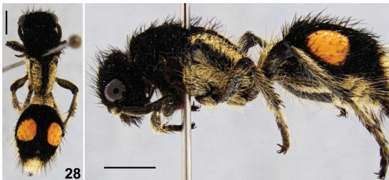
Figures 28–29. Traumatotutilla gemella André, 1906. 28) Habitus, dorsal view. 29) Habitus, lateral view. Scale bar: 3 mm.