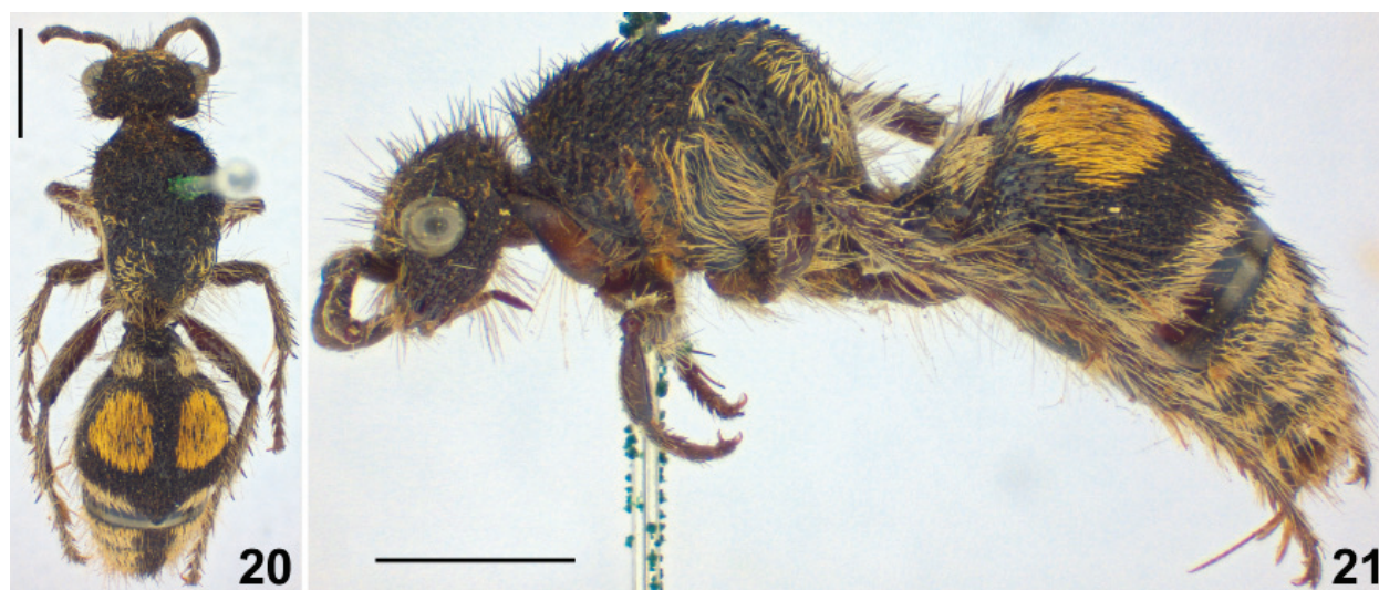
Figure 20–21. Traumatomutilla auriculata (Gerstaecker, 1874). 20) Habitus, dorsal view. 21) Habitus, lateral view. Scale bar: 3 mm.