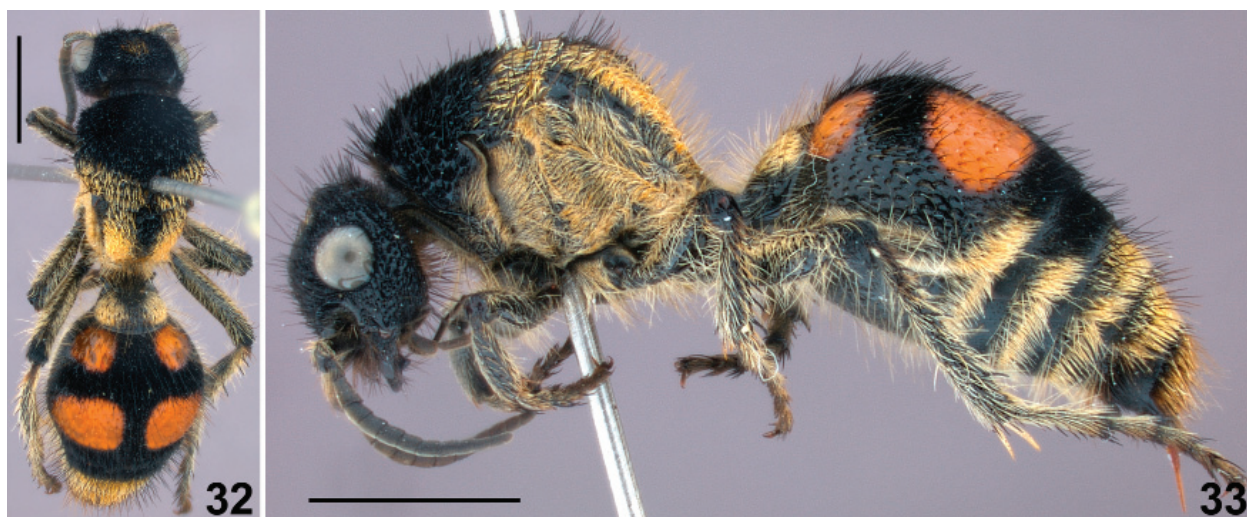
Figures 32–33. Traumatomutilla inermis (Klug, 1821). 32) Habitus, dorsal view. 33) Habitus, lateral view. Scale bar: 3 mm.