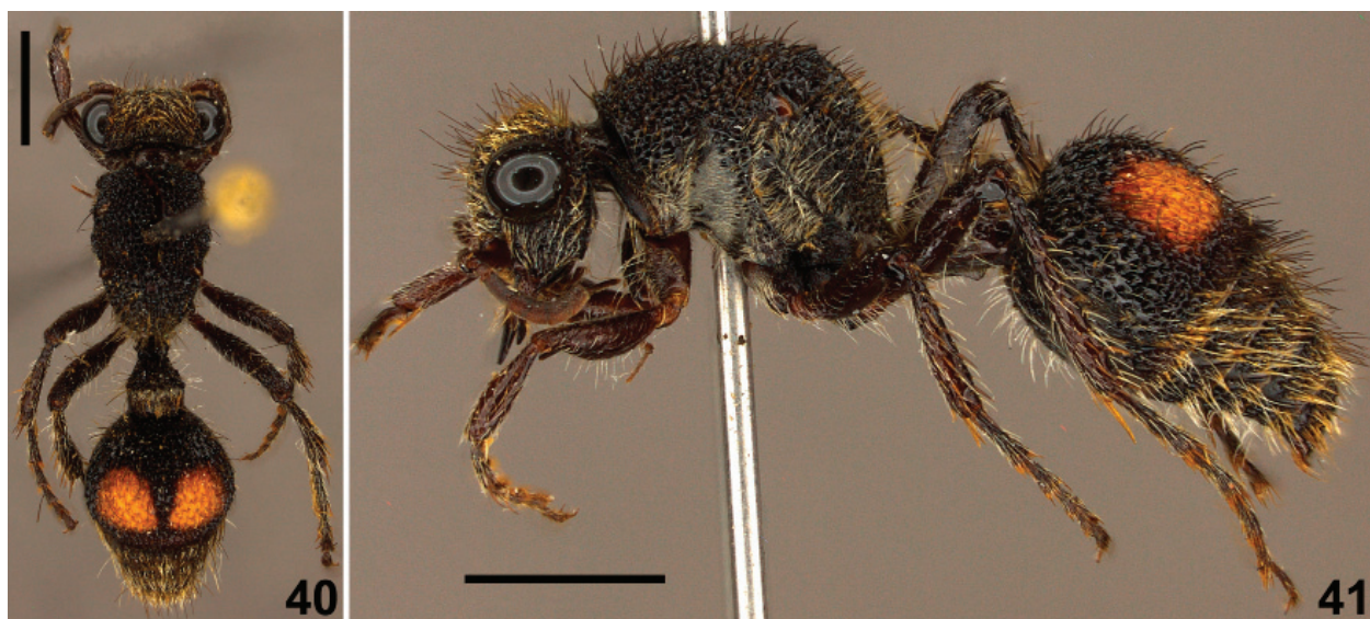
Figures 40–41. Traumatomutilla tabapua Casal, 1969. 40) Habitus, dorsal view. 41) Habitus, lateral view. Scale bar: 2 mm.