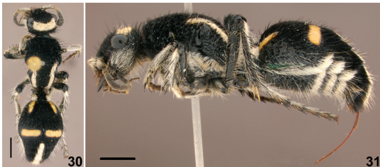
Figures 30–31. Traumatomutilla indica (Linnaeus, 1758). 30) Habitus, dorsal view. 31) Habitus, lateral view. Scale bar: 2 mm.