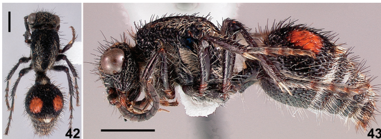
Figures 42–43. Traumatotutilla trochanterata (Gerstaecker, 1874). 42) Habitus, dorsal view. 43) Habitus, lateral view. Scale bar: 2 mm.