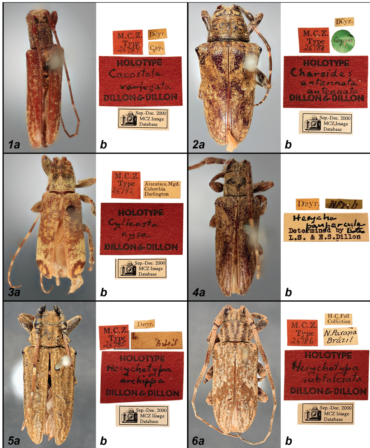
Figures 1–6. Six species of Onciderini. Fig. 1. Cacostola variegata Dillon and Dillon (a, dorsal habitus; b, labels). Fig. 2. Charoides antennata antennata Dillon and Dillon (a, dorsal habitus; b, labels). Fig. 3. Cylicasta nysa Dillon and Dillon (a, dorsal habitus; b, labels). Fig. 4. Hesycha crucifera Dillon and Dillon (a, dorsal habitus; b, labels). Fig. 5. Hesychotypa archippa Dillon and Dillon (a, dorsal habitus; b, labels). Fig. 6. Hesychotypa subfasciata Dillon and Dillon (a, dorsal habitus; b, labels).