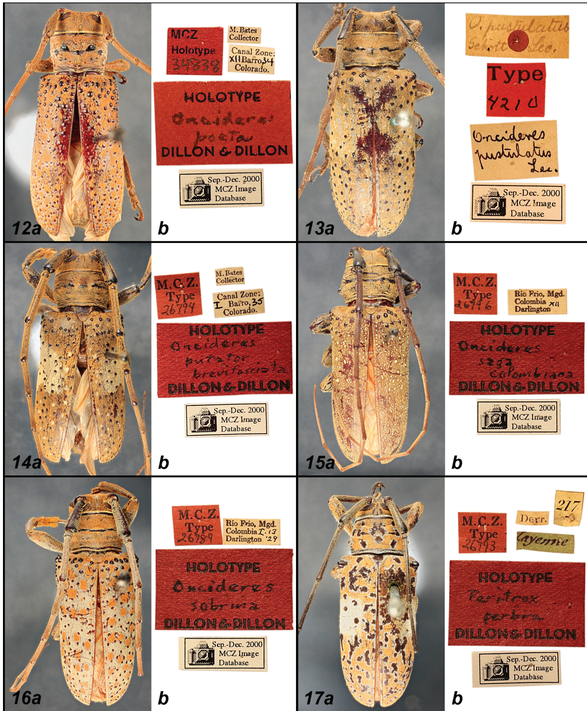
Figures 12–17. Six species of Onciderini. Fig. 12. Oncideres poeta Dillon and Dillon (a, dorsal habitus; b, labels). Fig. 13. Oncideres pustulata LeConte (a, dorsal habitus; b, labels). Fig. 14. Oncideres putator brevifasciata Dillon and Dillon (a, dorsal habitus; b, labels). Fig. 15. Oncideres saga colombiana Dillon and Dillon (a, dorsal habitus; b, labels). Fig. 16. Oncideres sobrina Dillon and Dillon (a, dorsal habitus; b, labels). Fig. 17. Peritrox perbra Dillon and Dillon (a, dorsal habitus; b, labels).