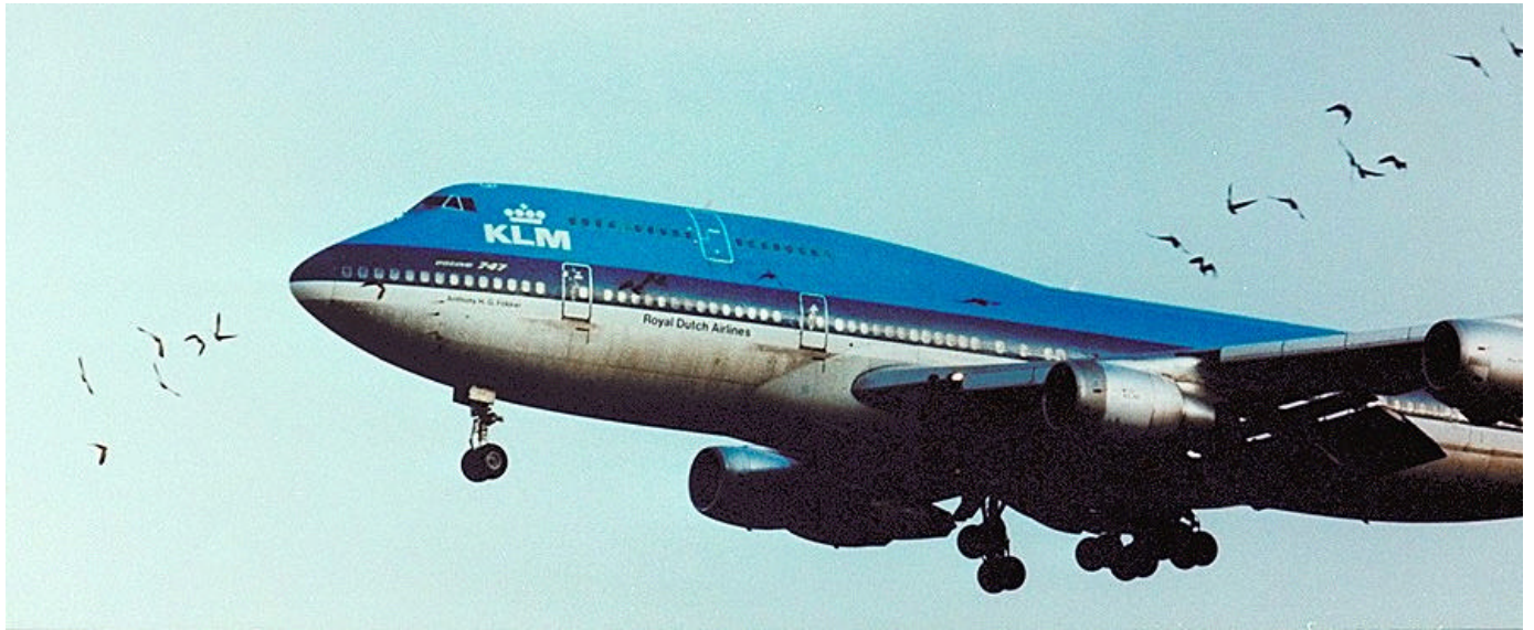
Figure 4 Same Event a short time later. Birds are now aware of aircraft and have initiated evasive actions.