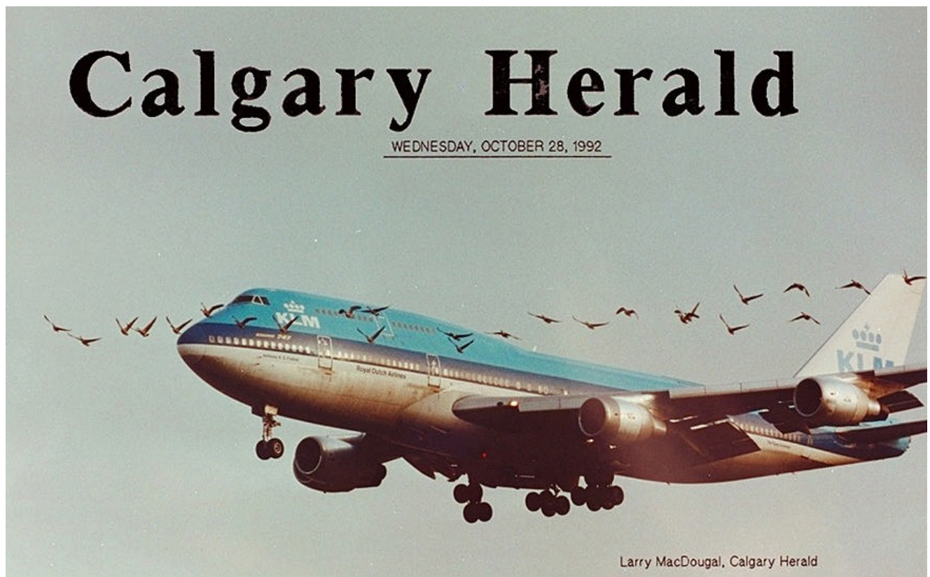
Figure 3 Boeing 747 Encounter with a Flock of Canada Geese just prior to Bird Ingestion in Outboard Left Wing Engine. Birds appear to be unaware of aircraft's presence.

An illustration of a geese flock exposure with single engine ingestion was a Boeing 747 encounter with a flock of Greater Canada Geese on approach to Calgary in 1992. This encounter is shown in Figures 3 and 4. This event resulted in one goose being ingested in the left outboard engine. Damage to the engine was heavy and fortunately there was no significant power loss.