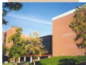
Nebraska Hall; Home to EM 1996 - present