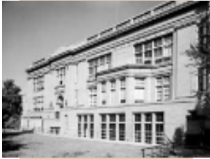
Bancroft Hall; Home to EM 1941- 1996

Since the department faculty have changed significantly in the last 10 years, below is an update of our current faculty, including the year they started and their current research interests.